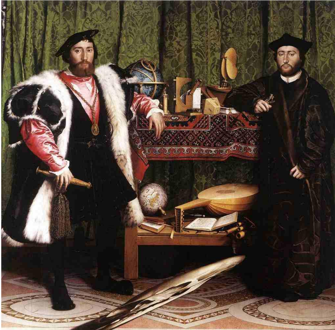
Fig. 1: Hans Holbein, The Ambassadors , 1533

the most prevalent non-Christian 'Other' that confronted Europe, 3 'persistently capturing the headlines and profoundly transforming the geopolitics of (and beyond) the Mediterranean world.' 4 Indeed, the Empire was arguably the most powerful agent in international relations at